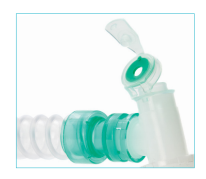
Airway Management • Patient Connections